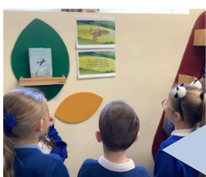
Hook: Fairy Tale Scavenger Hunt