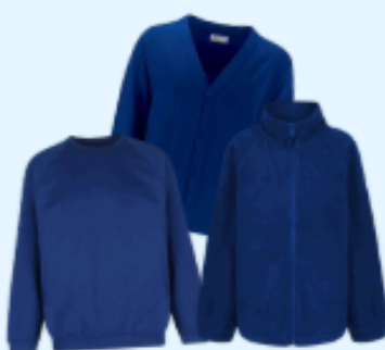
Blue cardigan, jumper or fleece Oldfleet branded items can be purchased from: rawcliffes.co.uk