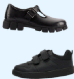
Black school shoes or black trainers