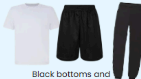
Black bottoms and white t-shirt