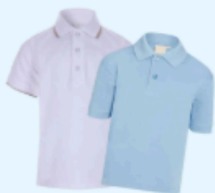
White or pale blue polo shirt