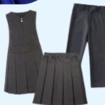
Black or grey trousers, skirt or dress